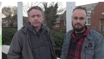
Running the ongoing campaign to re-open Winton Library Gardens