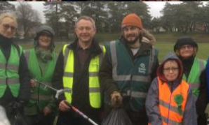
Helped the Stanfield Road Home Watch with student houses