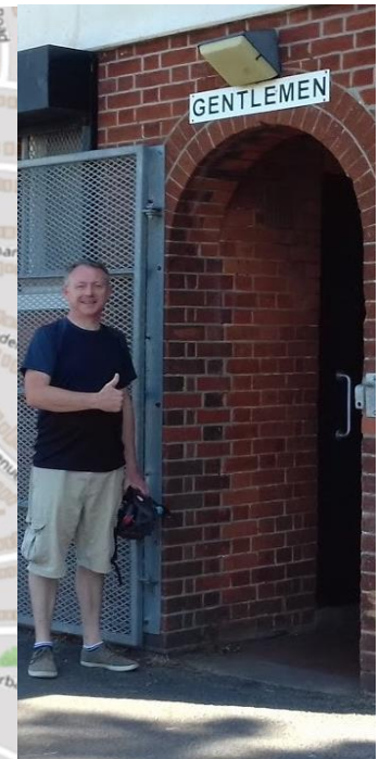
Organised getting the public facilities reopened in Winton Recreation Ground