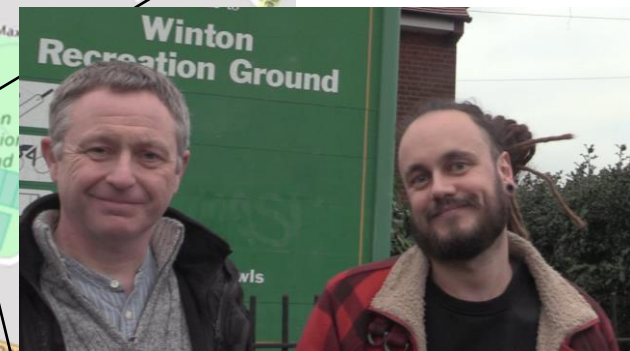
Arranged for new water fountains (for people and dogs) to be installed soon at Winton Rec