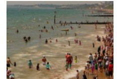
Bournemouth Green Councillor Chris Rigby secured a Town Hall panel hearing , to challenge Wessex Water over raw sewage discharges